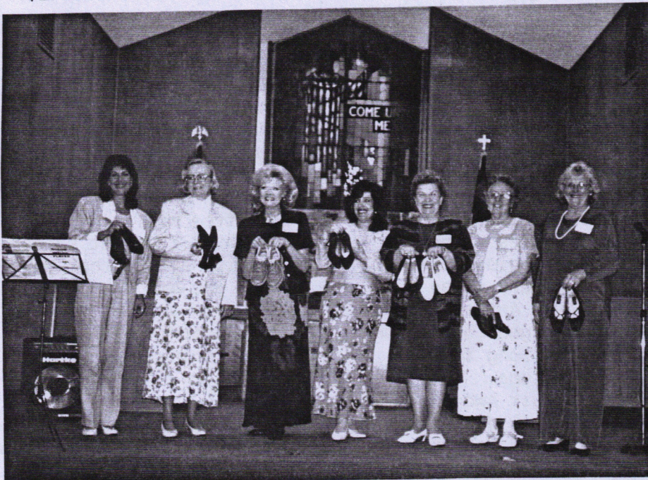
"Shoes to fill" Installation