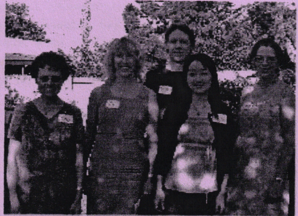
Welcome to our new members