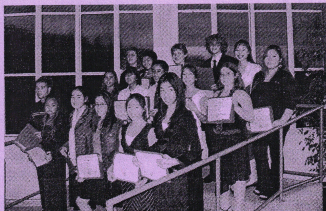
Participants in the Young Performers Showcase