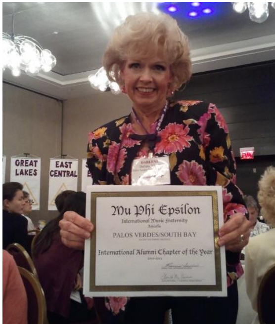
We won Int'l Chapter of the Year Award! (additional photo on page 3)