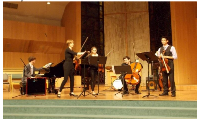
The Wyman Project