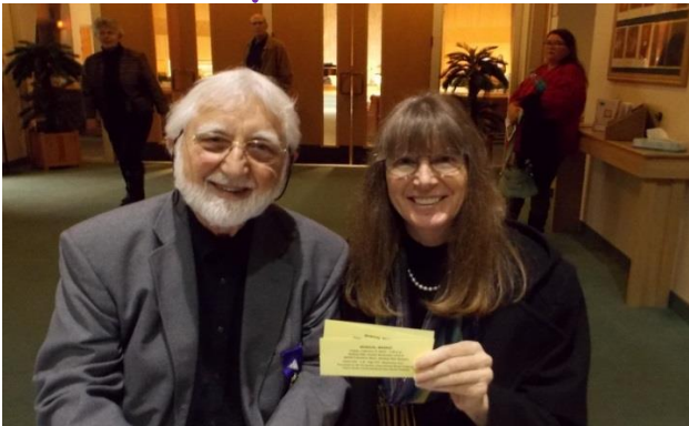
The Champions selling tickets