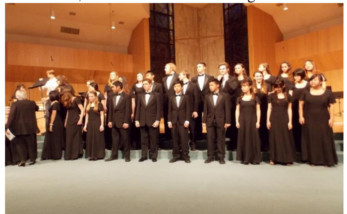
The Southland Singers