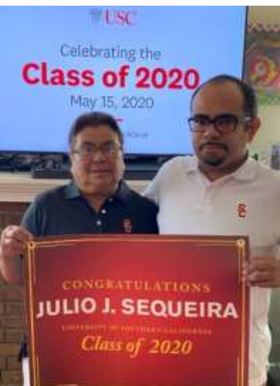
Graduation Day with my mom

By now the COVID-19 was making an impact in the US.