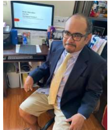
Defending my thesis

My journey began in December 2019. Plan A was to study the musical experiences of immigrant music students. Unfortunately, USC's Institutional Review Board (IRB) determined I had a conflict of interest since I would be interviewing my students at the high school where I teach. I had to abandon that idea and scramble to find a teacher to host the study. Luckily, one of my colleagues had agreed. Threat averted! — or so I thought.